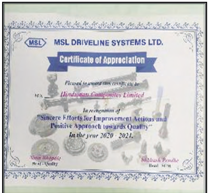
Award from MSL Driveline for Product improvement and quality