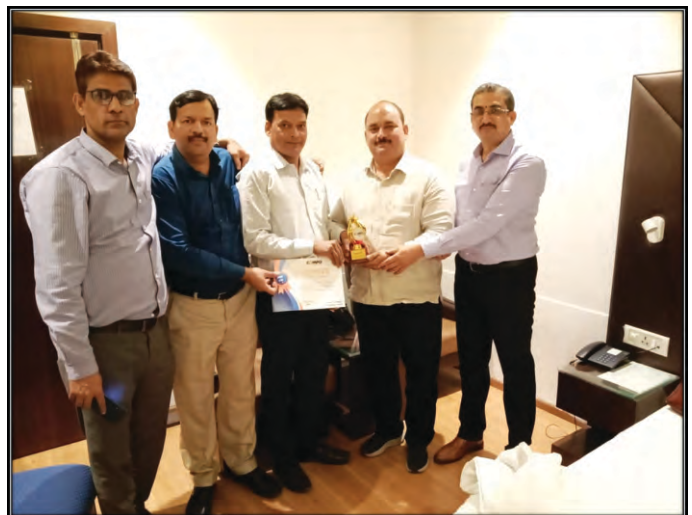
Recognition to Sales (aftermarket) Achievers in the year 21-22