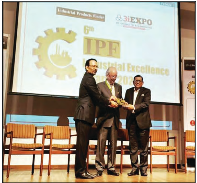
Fastest Growing Company (Medium –Auto Ancillary) awarded by IPF Industrial Excellence